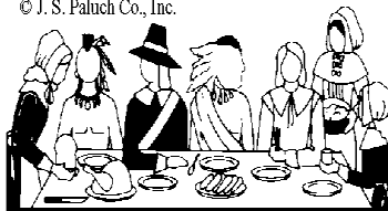
Thank You Lord

Bulletin from the Home School Association Save the Date...Mark your calendar...the Annual Christmas Fair will be on Saturday, December 7 th and Sunday, December 8 th .