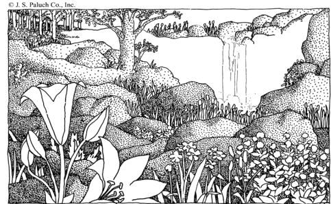
The Kingdom of Heaven Is at Hand.

Today's readings are filled with startling developments. We hear the clarion cry of one of those rare prophets announcing the coming of the Lord. Isaiah proclaims startling, surprising images of the nearly impossible reconciliation of opposites: calf and lion, leopard and young goat, child and serpent. Isaiah's vision sees all of these creatures living in harmony. This is Eden again; this is paradise. It is God's surprise and promise.